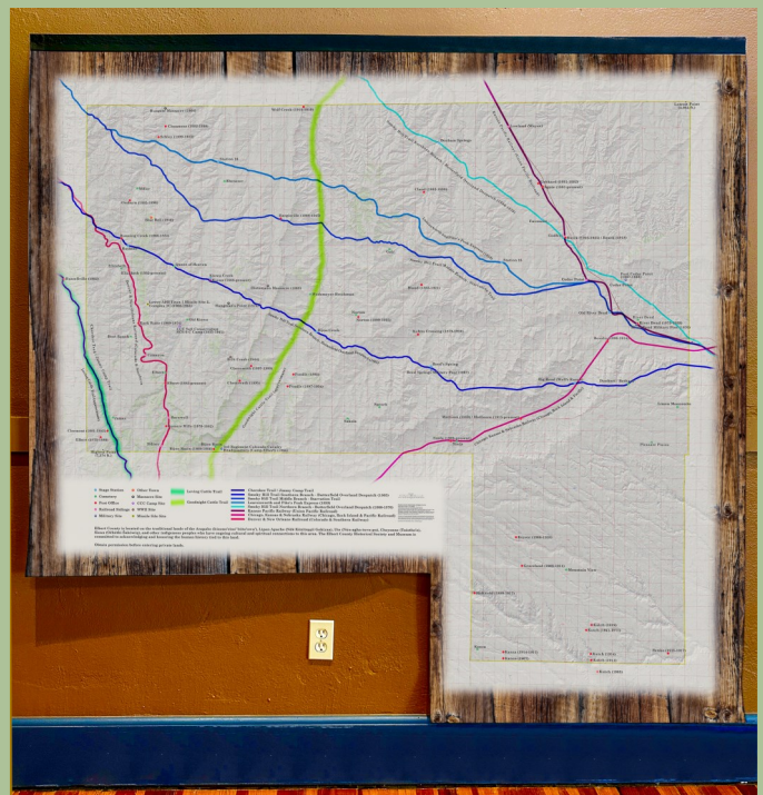
THE HISTORIC SITES MAP MADE IT DEBUT LAST SUMMER AND QUICKLY BECAME A HIT WITH VISITORS.

The map is on display at the Elbert County Museum, and we invite you to come explore it this season. Whether you are a lifelong resident tracing your family's path or a visitor curious about the road beneath your wheels, the map offers a powerful way to connect with the land and the lives of Elbert County's past.