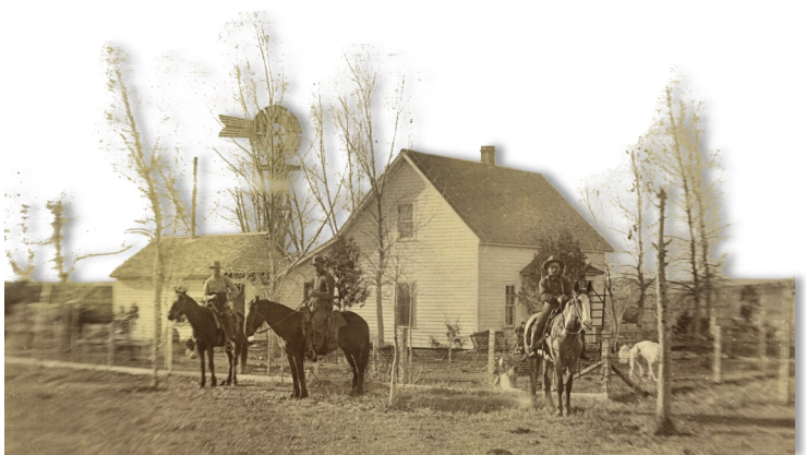
ABOVE: AN EARLY VIEW OF THE AUGUST BEUCK HOMESTEAD, 1890s