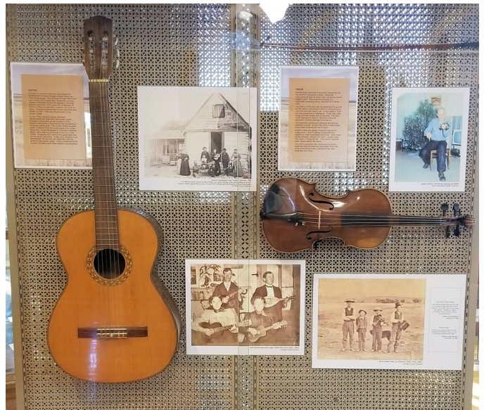
EARL WOOD'S FIDDLE AND STRING BOW FEATURED IN THIS SUMMER'S MUSIC ON THE PLAINS EXHIBIT

Earl Wood passed away on December 4, 1980 and was laid to rest in the Simla Cemetery.